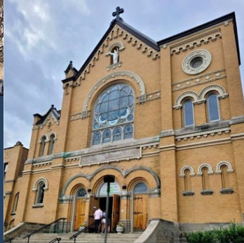
St. John Berchmans (SJB) 2517 W. Logan Blvd. Chicago, IL 60647 773-486-4300