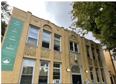
St. John Berchmans School 2511 W. Logan Blvd. Chicago, IL 60647