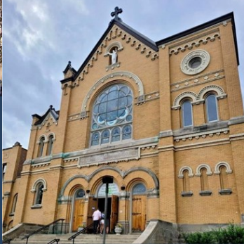
St. John Berchmans (SJB) 2517 W. Logan Blvd. Chicago, IL 60647 773-486-4300