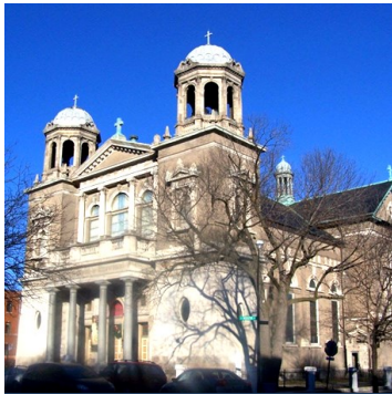
St. Hedwig (SH) 2226 N. Hoyne Ave. Chicago, IL 60647 773-486-1660