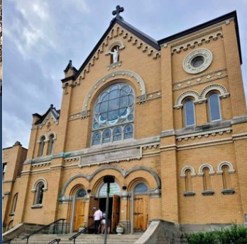
St. John Berchmans (SJB) 2517 W. Logan Blvd. Chicago, IL 60647 773-486-4300