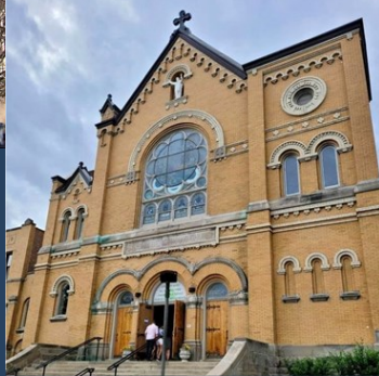
St. John Berchmans (SJB) 2517 W. Logan Blvd. Chicago, IL 60647