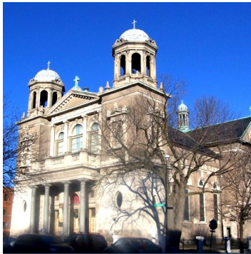
St. Hedwig (SH) 2226 N. Hoyne Ave. Chicago, IL 60647