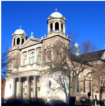
St. Hedwig (SH) 2226 N. Hoyne Ave. Chicago, IL 60647