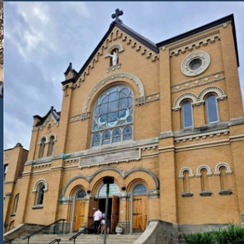
St. John Berchmans (SJB) 2517 W. Logan Blvd. Chicago, IL 60647