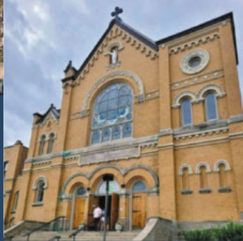
St. John Berchmans (SJB) 2517 W. Logan Blvd. Chicago, IL 60647