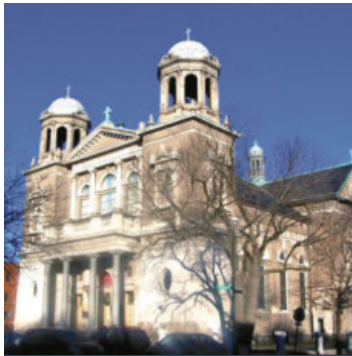
St. Hedwig (SH) 2226 N. Hoyne Ave. Chicago, IL 60647