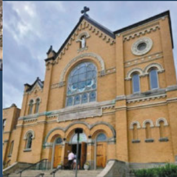
St. John Berchmans (SJB) 2517 W. Logan Blvd. Chicago, IL 60647