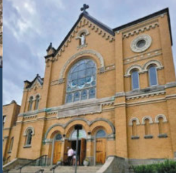
St. John Berchmans (SJB) 2517 W. Logan Blvd. Chicago, IL 60647