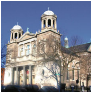
St. John Berchmans (SJB) 2517 W. Logan Blvd. Chicago, IL 60647